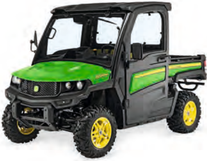
XUV Utility Vehicles