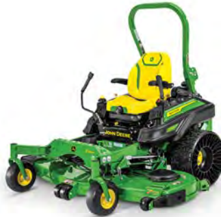
Zero Turn Mower (Commercial) Front Mowers (Residential)