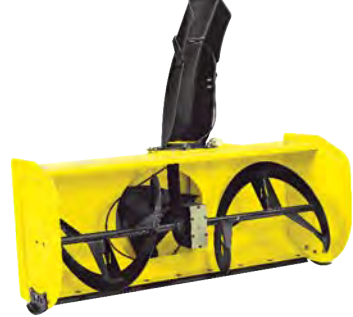
Mow-To-Snow Change Over