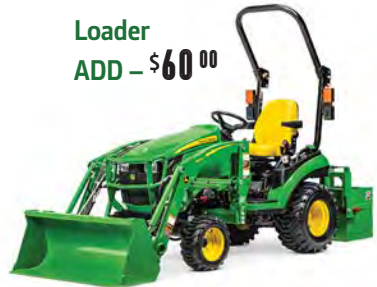
Compact Utility Tractors